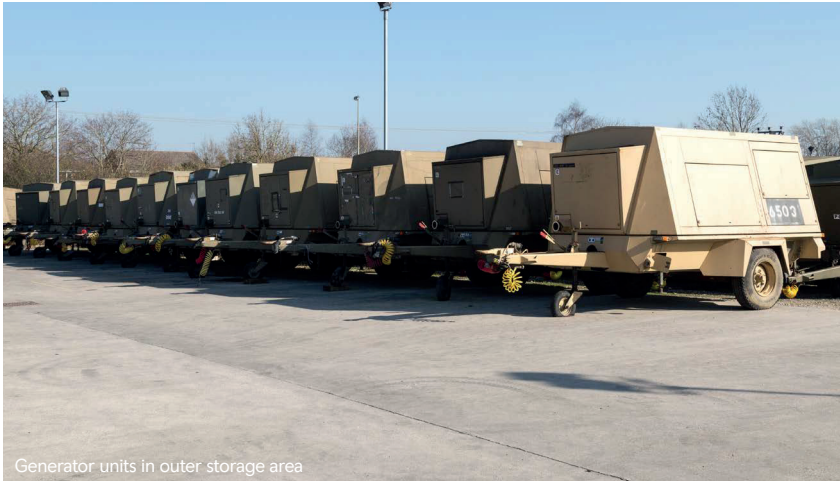
Generator units in outer storage area

Our UK premises are fully flexible to best suit our customers' requirements whether for production or equipment services. Current testing capabilities include 7 test beds, and on-site Electro Magnetic Compatability (EMC) testing. Test beds feature electrical load banks, a water brake dynamometer and a simulated sea water cooling facility.