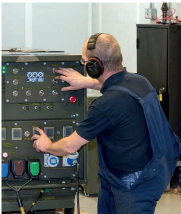
6.5kW Variable Speed Generator on Test