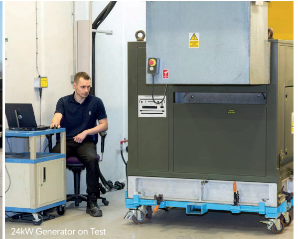
24kW Generator on Test